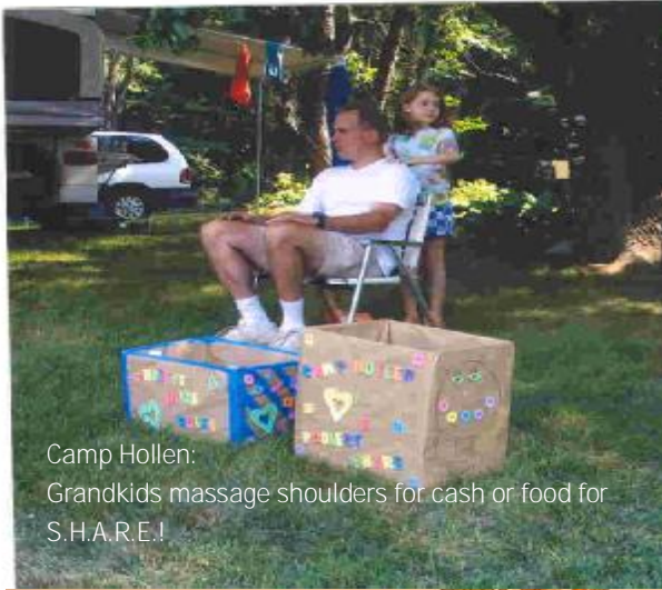
Camp Hollen: Grandkids massage shoulders for cash or food for S.H.A.R.E.!