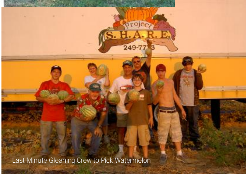
Last Minute Gleaning Crew to Pick Watermelon