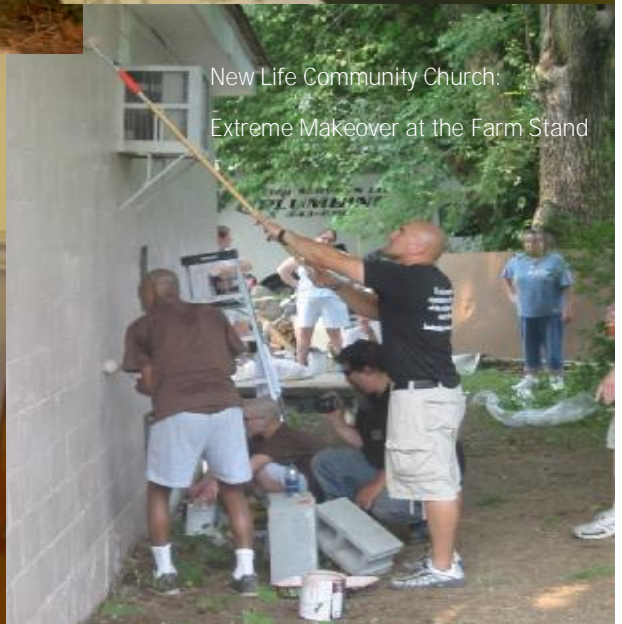
New Life Community Church: Extreme Makeover at the Farm Stand